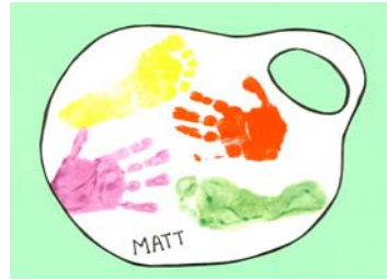
HAND & FOOT PRINTS